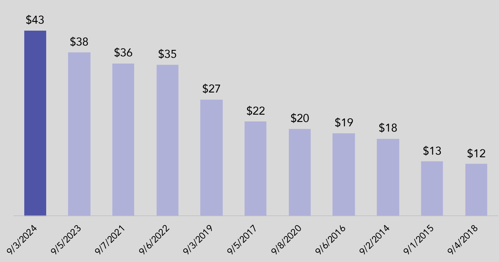
Sept 3, 2024 was also the largest USD IG deal count day of all time, with 29 distinct issuers tapping the market in a single day. The new milestone well exceeded the prior three records, each of which also occurred on Labor Day Tuesdays. With an additional 20 issuers coming to market today (Sept 4), nearly 50 distinct issuers have tapped the USD IG new issue markets in the first 48 hours following the Labor Day weekend.