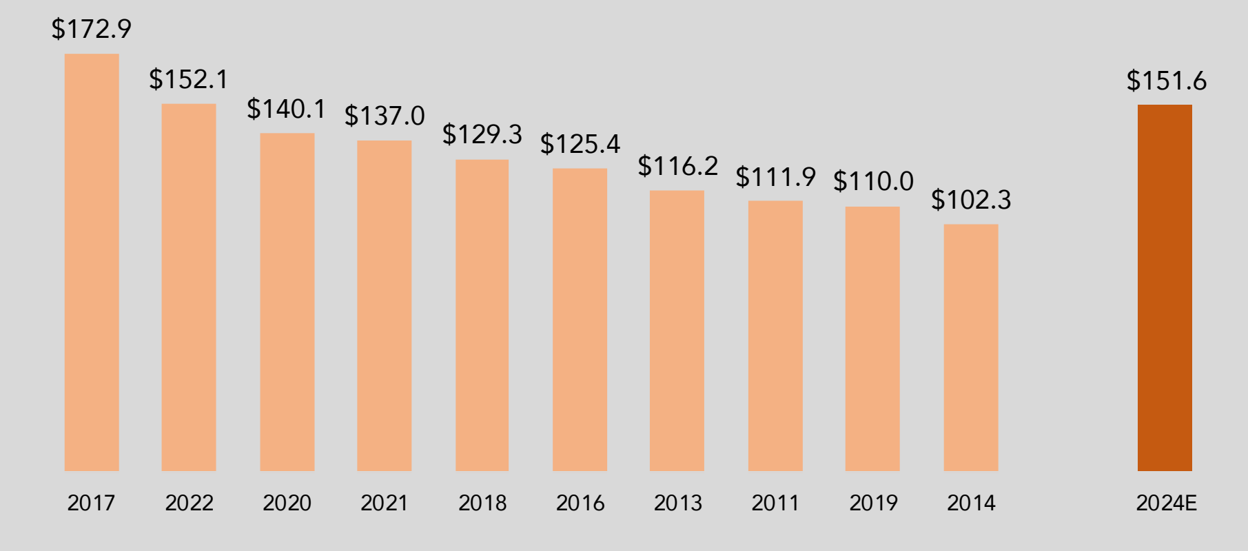
All time largest January USD IG issuance, bn

Data as of January 5, 2024. 2024 January issuance is CFR average.